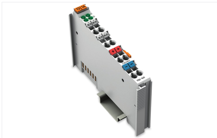
Color: ■ light gray