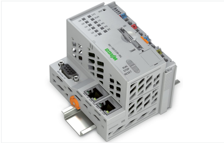
Color: ■ light gray