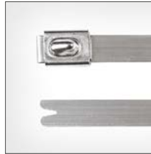
Stainless steel cable ties, uncoated, MBT_SS, MBT_HS.