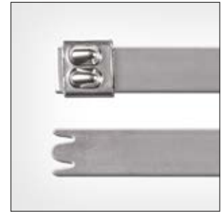
Stainless Steel Cable Ties, uncoated, MBT_XHS.

i Can support quality assurance in the production of food stuffs, for example HACCP.