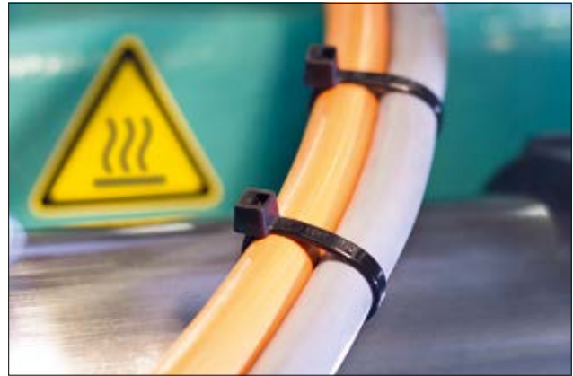
Heat stabilised T-Series cable ties up to +105 °C.