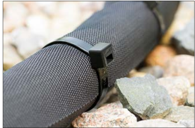
Impact resistant T-Series cable tie (PA66HIR(S)).