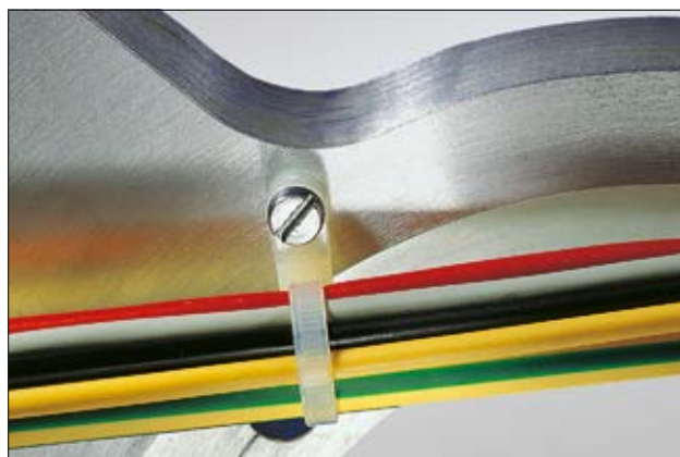
The mounting head ties can be easily screwed onto a panel.