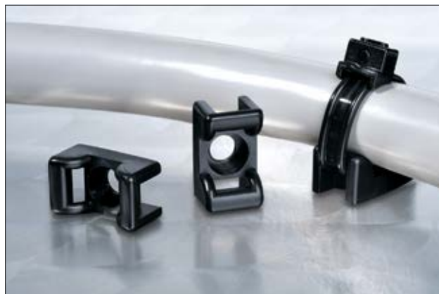
Cable Tie Mounts KR6G5, KR8G5 and CTM.