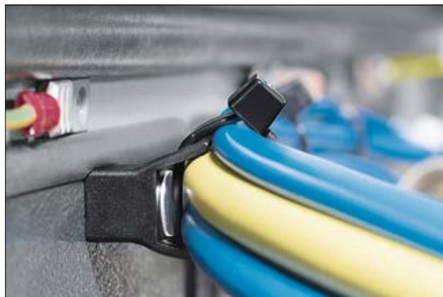
LOK02 fixing base application.