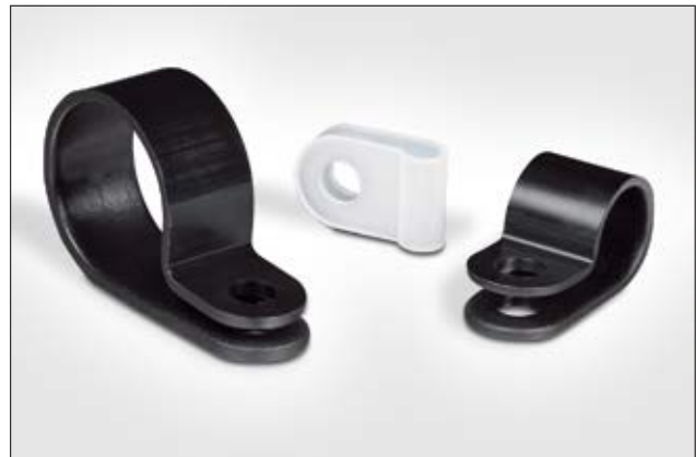
P-Clamps H1P - H18P in different dimensions.