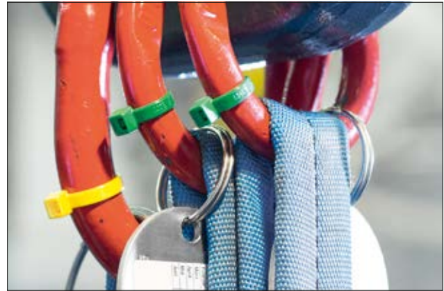
T-Series cable ties – ideally suited for colour coding.