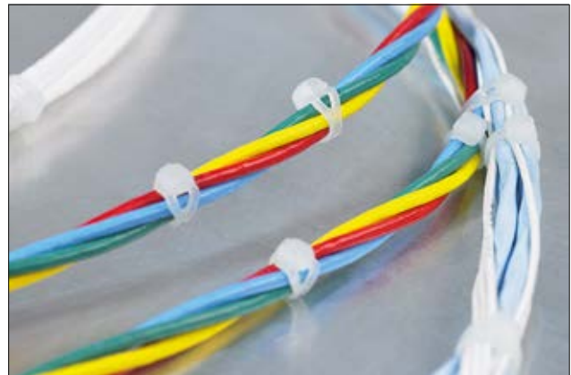
V-Series - the 90° angled head perfectly fits onto the bundle.