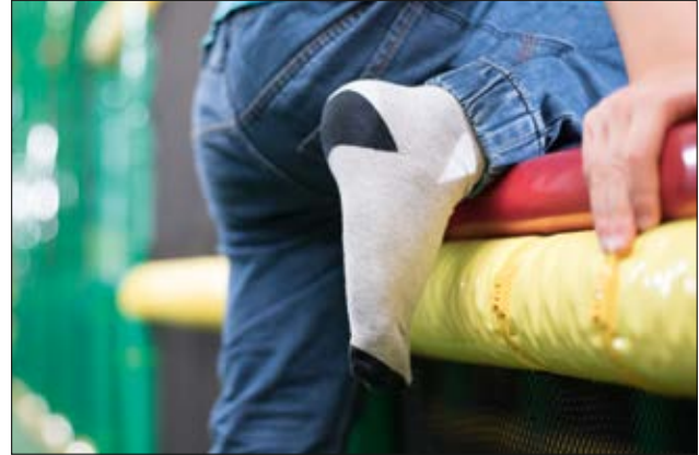
Low profile cable ties are minimising the risk of injury and simultaneously taking it easy on the material.