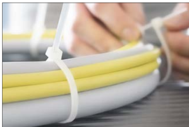
RELK releasable cable ties for temporary bundling.