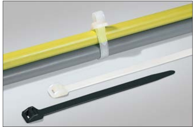
RT250 Cable Ties: Ideal for larger or heavier bundles these ties can be opened and reused.