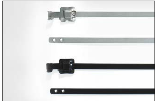
MLT-Series. Releasable stainless steel buckle tie with and without coating.

i The MLT-Series (up to 10 mm) can be used in combination with the stainless steel P-Mount. The mount is simple to install with a screw or bolt and ensures a durable fixing solution. Please see page 173.