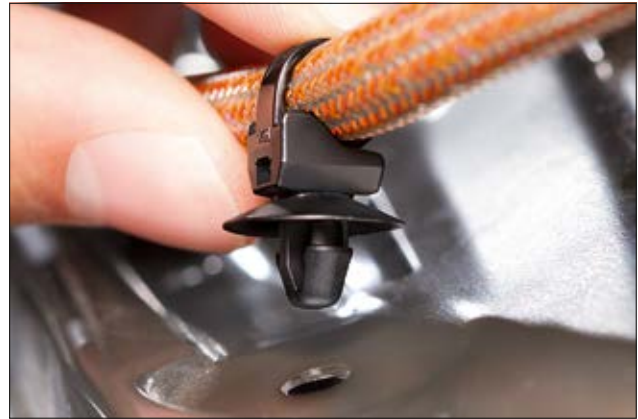
The disc at the head of the T50SOSST6.5E protects the bore against dirt and splashes.