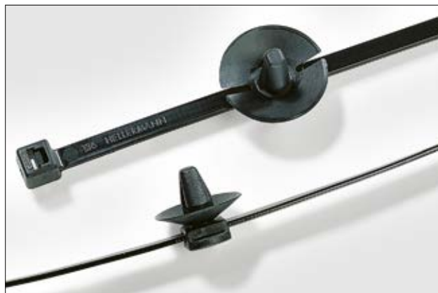
Being a two-piece assembly allows the tie head to be located in the most convenient position.