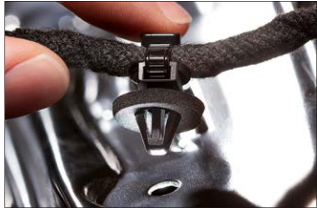
The additional seal protects against the ingress of moisture.