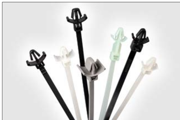
A wide range of arrowhead fixing ties which are suitable for different panel thicknesses and hole diameters.