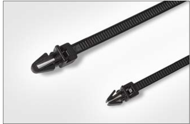
The arrowhead design allows these fixing ties to be used in areas with limited space.