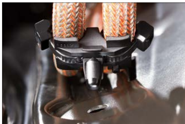
T50SOSDSFT6.5 for parallel routing.