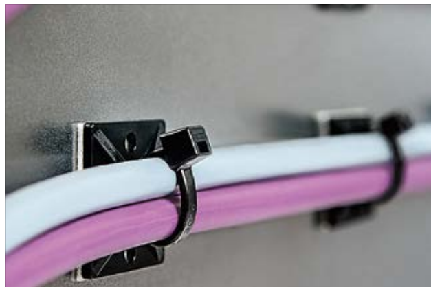
MB-Series Mounts with square design.