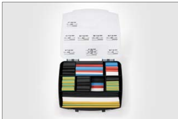
ShrinkKit 321 Universal Basic - 177 pcs 3:1 heat shrink assortment.