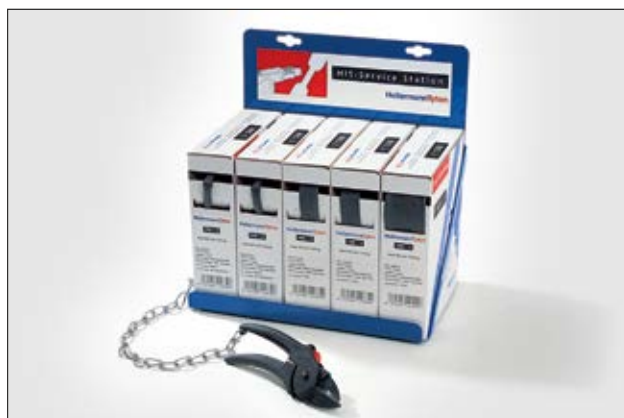
HIS-Service Station contains 5 dispensers and a special cutter.