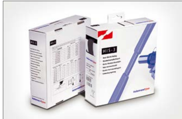
HIS-3 can fit highly variable cable dimensions.