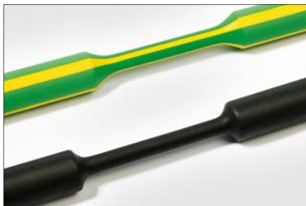
TREDUX shrinks a maximum of 3:1.