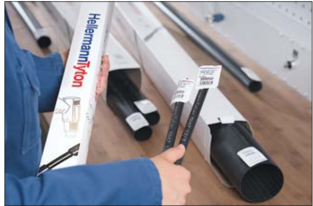
TREDUX MA47 in handy display carton.