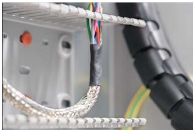
TF21 - available in a wide range of colours and sizes.