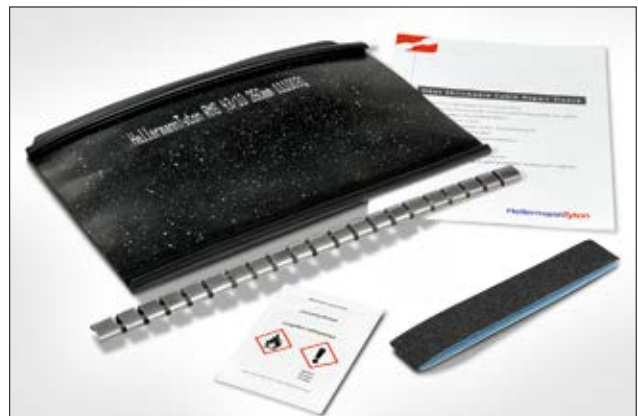
RMS: Repair sleeve, steel closure, abrasive strip, cleaning sachet, instruction sheet.