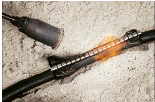
RMS wrap-around sleeves for rapid and secure cable repair.