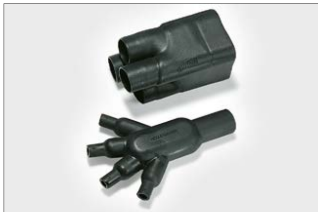
403-1 supplied / fully recovered.