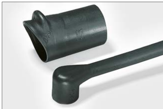
1123-1-G supplied / fully recovered.

For Material / Adhesive information please refer to page 274, 275.