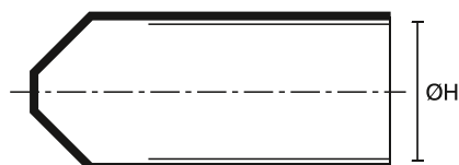
a: Expanded form (supplied)