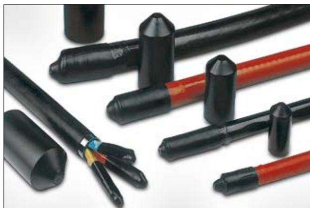
The appropriate end cap for every cable diameter and cable types.