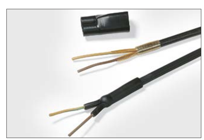
Adhesive tape HMT200A for sealing against humidity.