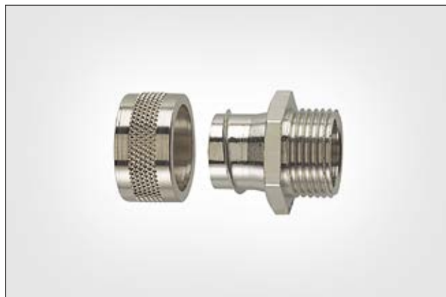
HelaGuard PCS-FM Fixed External Thread.

Fittings with PG and swivel threads are also available. For our complete range of conduits and fittings, please see our HelaGuard catalogue.