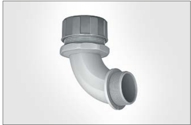
PSR-90 90° Elbow.

i Fittings with PG-Thread and in 90° and 45° are also available. For our complete range of conduits and fittings, please see our HelaGuard catalogue.