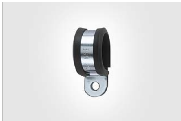
HelaGuard AFCS Fixing Clip, Galvanised Steel and PVC Liner.