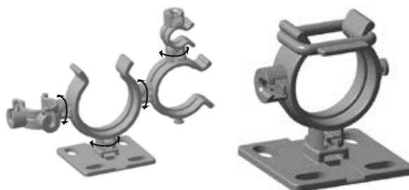
Multiple clips can be joined. Clips swivel freely.