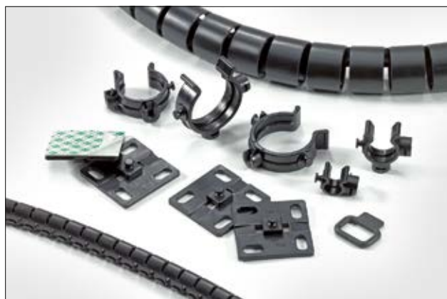
Helawrap self-adhesive and screw mount bases and clips.