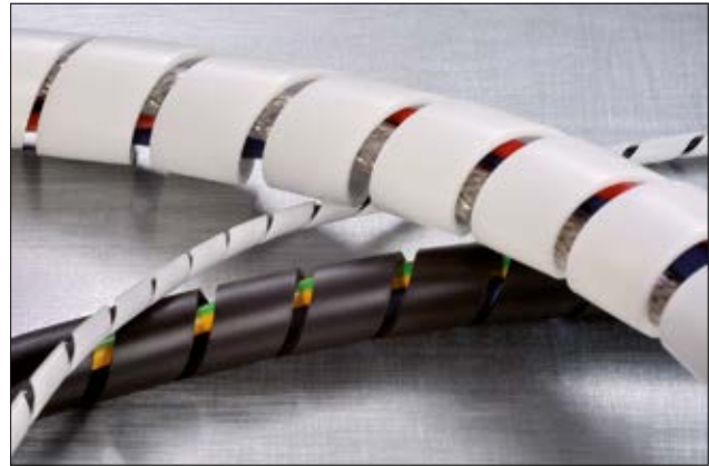
SBPEFR spiral binding is available in several diameters and in the colours black and white.