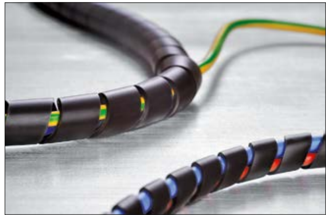
Spiral binding SBPAV0.