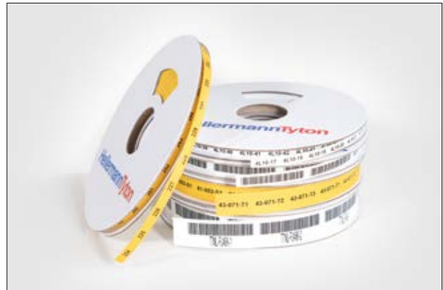
TLFX – European rail approved heat shrink marker material.