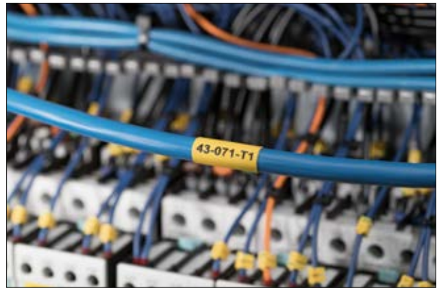
TLFX- high performance halogen free heat shrink tube.