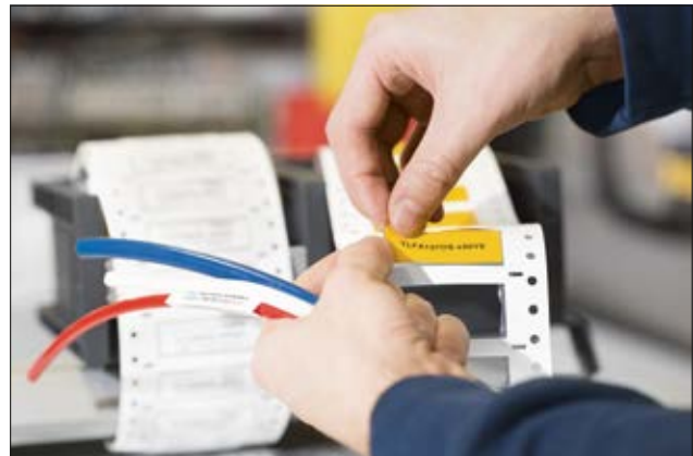
Shrinkable rail approved markers TLFX DS.