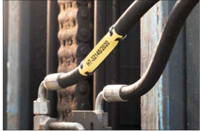
Cable marker for easy marking in tough environments.