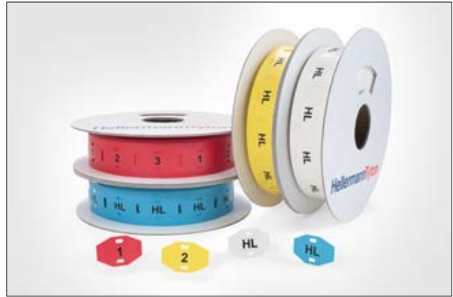
TAGPU diamond shaped form for easy application with only one cable tie.