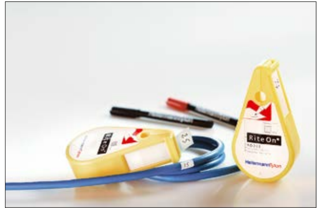
Easy to write and dispense labels with RiteOn label dispenser.