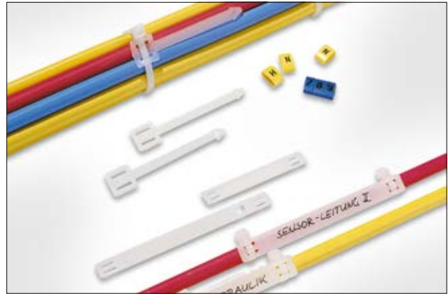
A clearly better way of identifying cables and pipes.