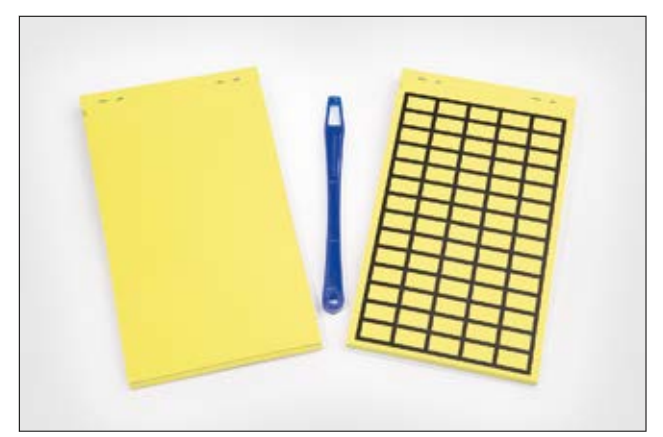
Always on hand: Labels in a convenient, pocket sized and lightweight booklet.