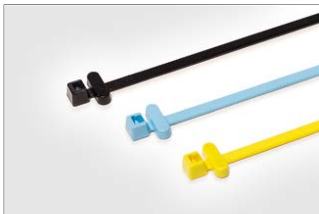
T50RFID – cable ties with RFID transponder.