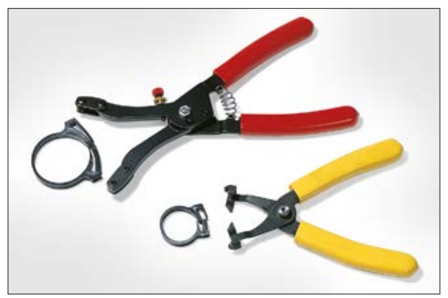
Snapper Application Tools MSNP1-70 and ASNP24-70.