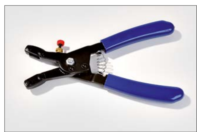
Snapper Application Tool ASNP2-22.

Pneumatic Tools for Snapper are available on request. Contact us!