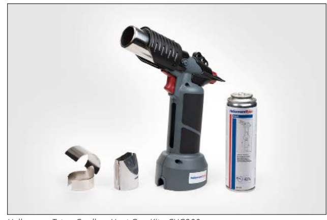
HellermannTyton Cordless Heat Gun Kit - CHG900.