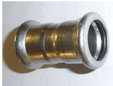
Fig. 1 Fitting before installation (EPDM)