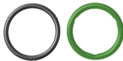
Fig. 2 EPDM and Viton O-Rings