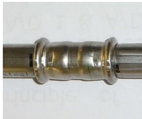
Fig.3 Pressed Fitting