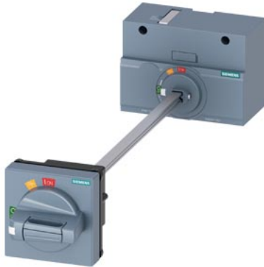
door mounted rotary operator standard IEC IP65 with door interlock accessory for: 3VA12